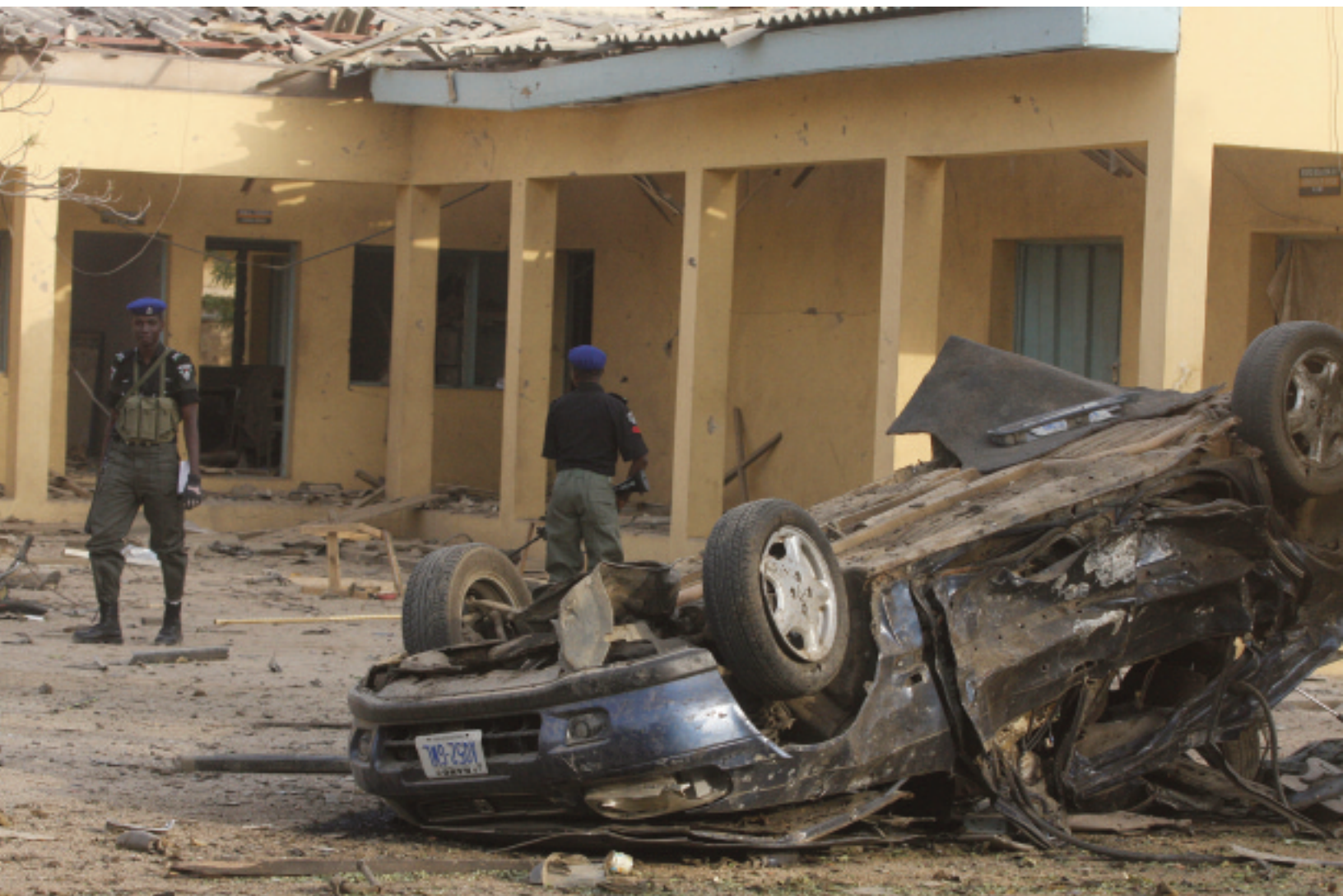
Police officers stand guard outside the police headquarters in the city of Kano following a suicide car bomb attack on January 20, 2012 by Boko Haram.