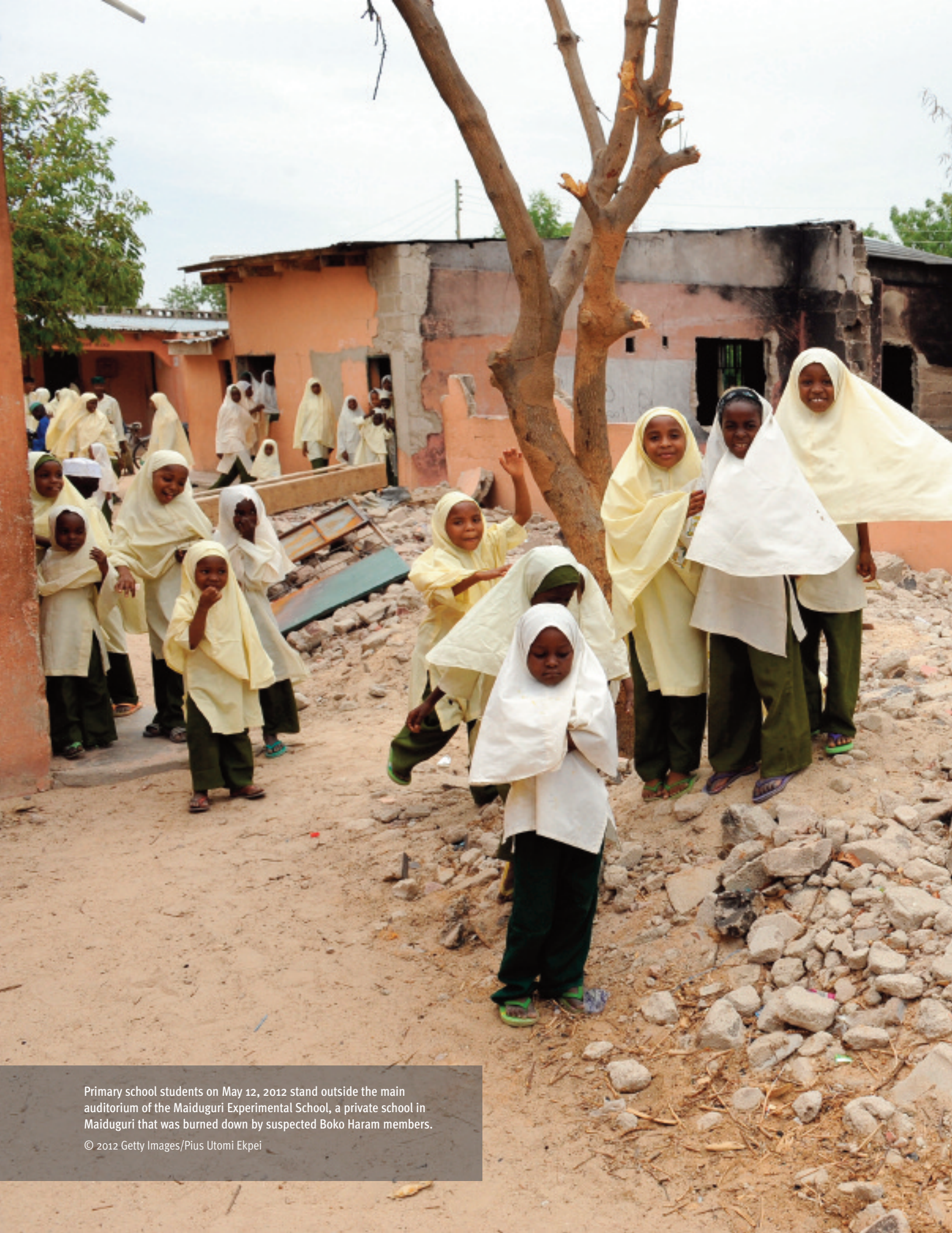
Primary school students on May 12, 2012 stand outside the main auditorium of the Maiduguri Experimental School, a private school in Maiduguri that was burned down by suspected Boko Haram members.