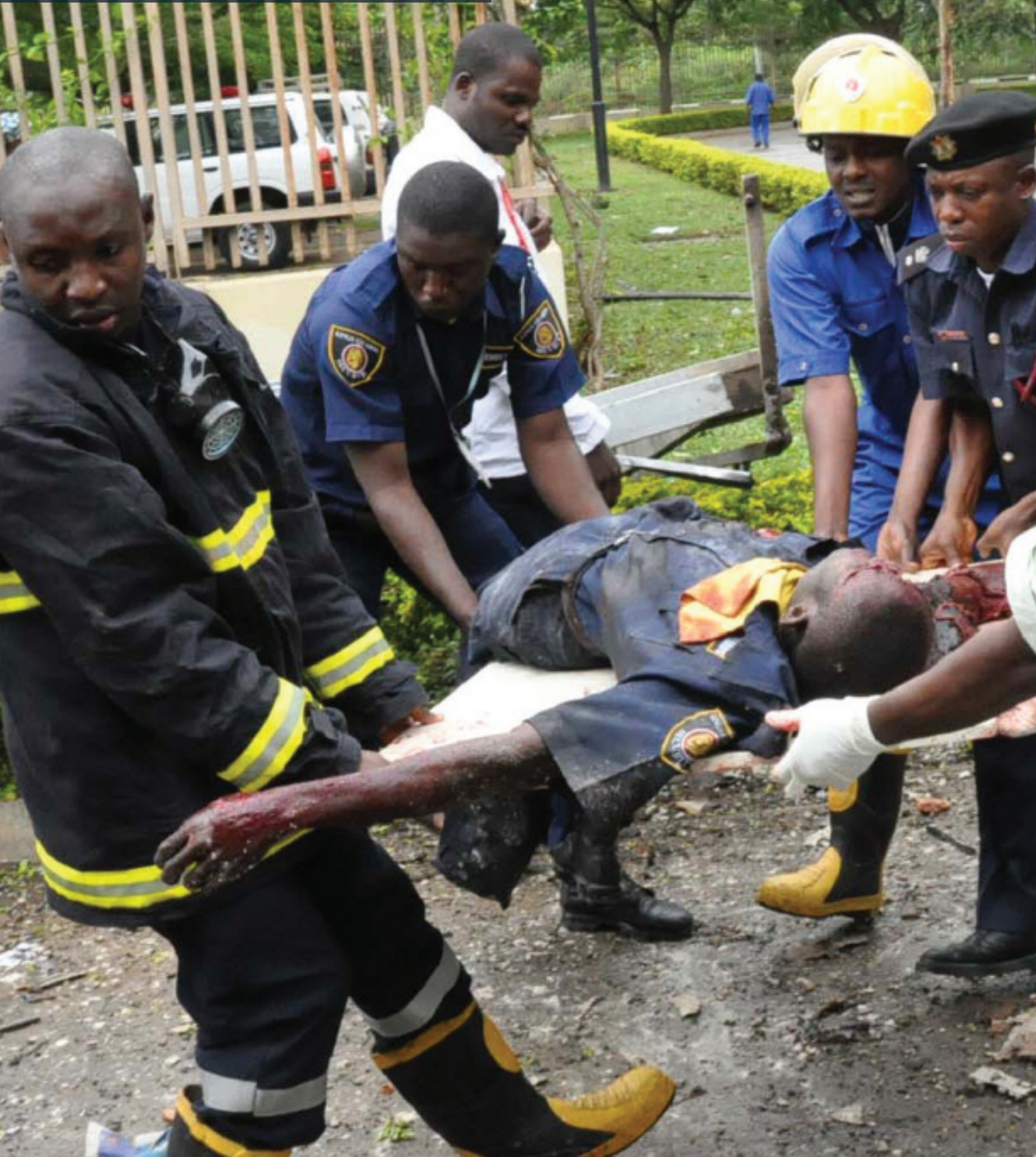
Rescue workers evacuate a wounded man from the United Nations building in Nigeria's capital, Abuja, following a suicide car bomb attack on August 26, 2011 that killed 25 and injured more than 100. Boko Haram claimed responsibility for the attack.