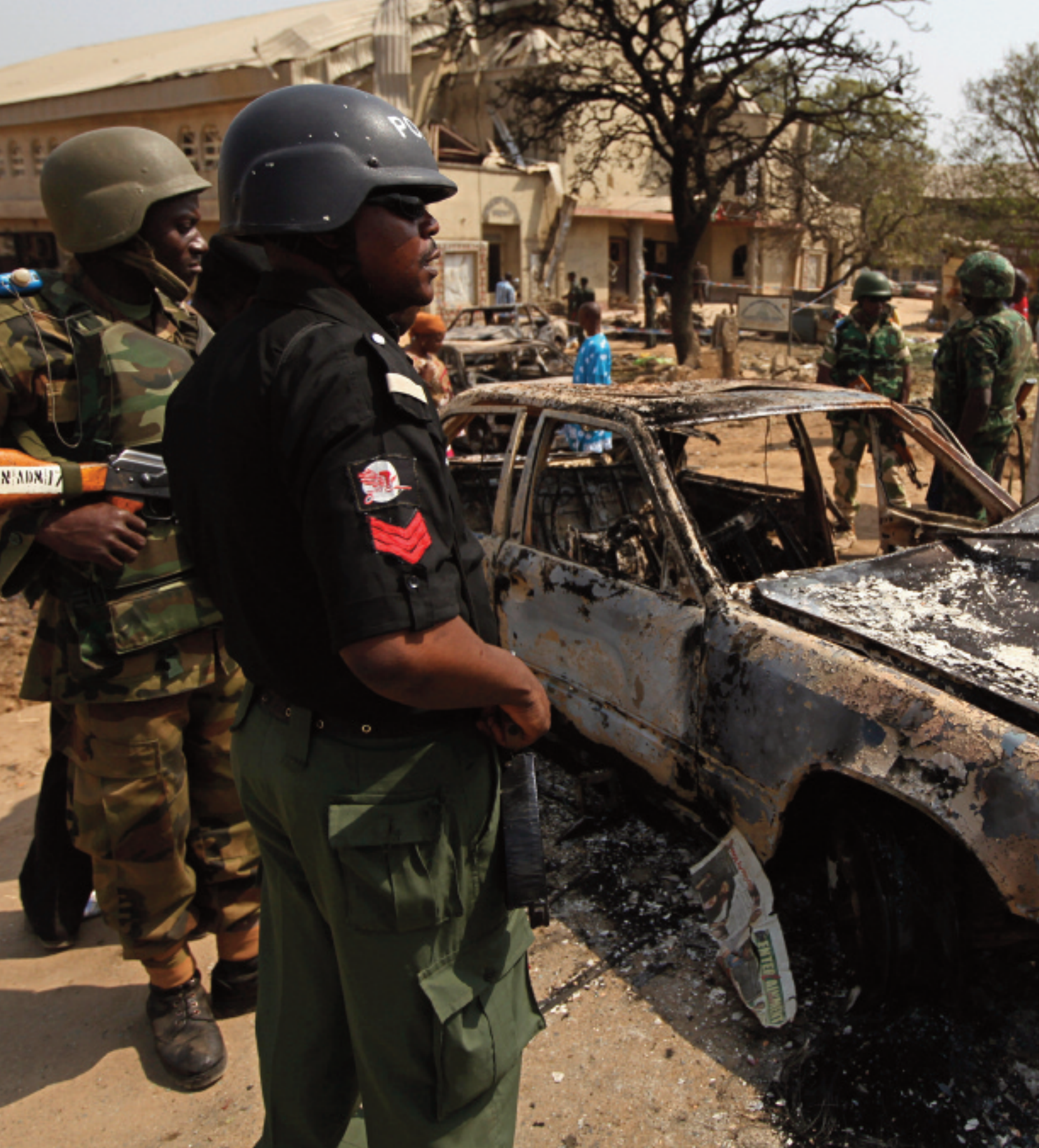
Nigerian police and soldiers view the scene of a suicide car bomb attack on the St. Theresa Catholic Church in Madalla, Niger State, on December 25, 2011 that killed 43 and injured dozens. Boko Haram claimed responsibility for the bombing.